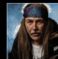
Uli Jon Roth Solo, Scorpions