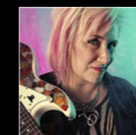
Jennifer Batten Solo, Jeff Beck, Michael Jackson